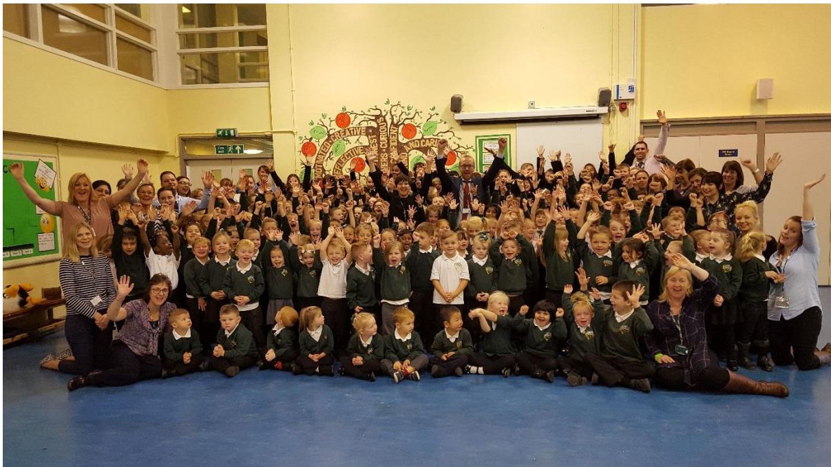
Celebrations all round at Christ Church Academy